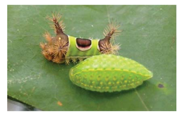
Fig. 1. Examples of a physically defended limacodid species, Acharia stimulea (upper left, with spines), and a cryptic limacodid species, Lithacodes fasciola (lower right, no spines). (Online figure in color.)

goal of this forum piece is to encourage a more inclusive approach to thinking about the ways EFS could affect the ecology and evolution of parasitoids and other carnivores.