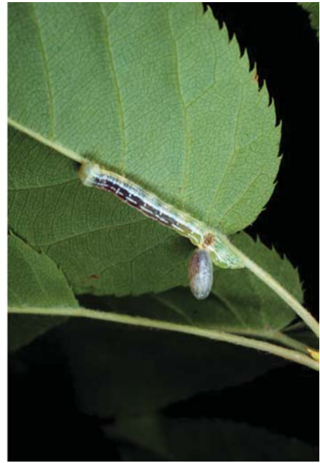
Fig. 4. Generalist caterpillars are attacked by both predators (e.g., black-capped chickadee feeding on a caterpillar, on left) and parasitoids (e.g., generalist noctuid Himella intractata Morrison (currently, H. fidelis Grote) parasitized by a hymenopteran parasitoid, on right). (Online figure in color.)

ing the larval parasitoid's exposure to bird predation while in the host.