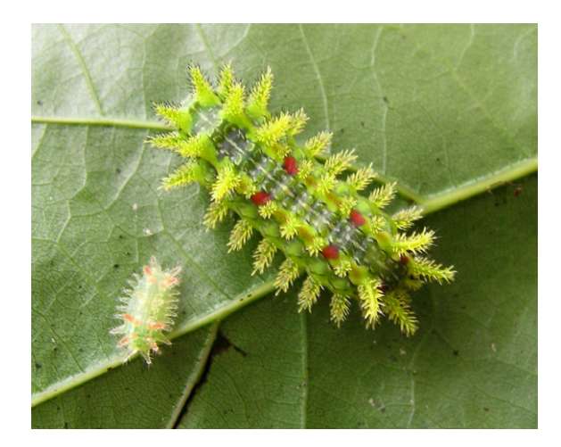
Figure 1 A pair of small (early instar) and large (late instar) Euclea delphinii caterpillars depicted prior to being exposed to parasitoid attack in the field. Note the difference in color patterning and physical armature (stinging spines) between the instars.

Here, we report the results of a series of manipulative experiments designed to test the hypothesis that natural enemy taxa differ in their attack rates and/or consumption of a shared resource: caterpillars of the spiny oak slug [ Euclea delphinii Boisduval (Lepidoptera: Limacodidae)]. By simultaneously exposing small and large E. delphinii caterpillars (Figure 1) to natural enemies on a small subset of